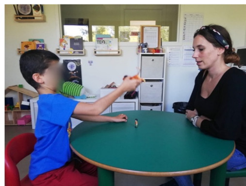
Figure 1. Experimental setup.