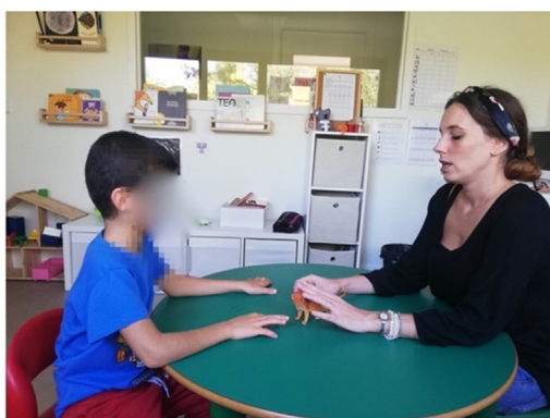
Participant viewing the event.